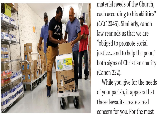
Volunteers organize stock for a distribution hub that helps supply fresh produce and nutritious food to pantries and soup kitchens in underserved areas.

The money you give runs your parish and provides assistance to the L poor, both locally and throughout your diocese. Scripture mentions the disciples offering money to meet the needs of the poor. The Catechism of the Catholic Church states: "The faithful also have the duty of providing for the