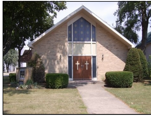
Immaculate Conception Catholic Mission