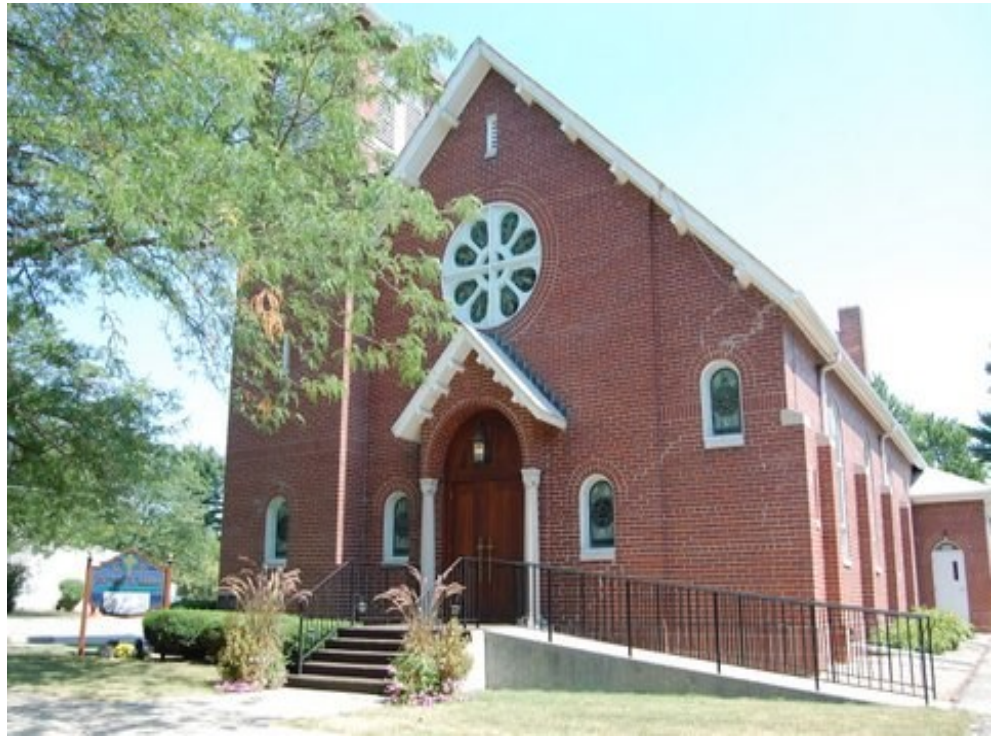
Our Lady of Lourdes Catholic Church