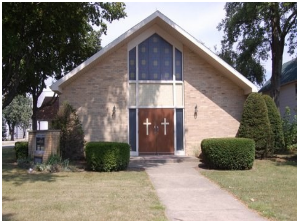
Immaculate Conception Catholic Mission